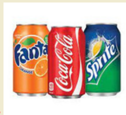
Soft Drinks $5