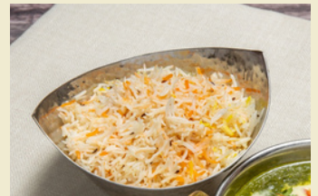
Basmati Rice $15