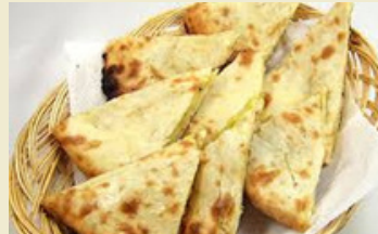
Potato Naan $15