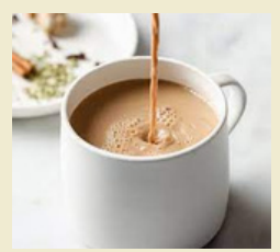
Masala Tea $15