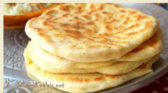
Cheese Naan $20