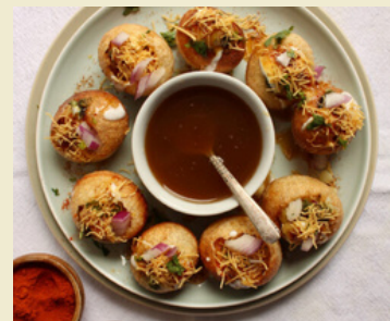
Pani Pouri 50$

While ordering kindly state your preference for mild,medium or hotly spiced food