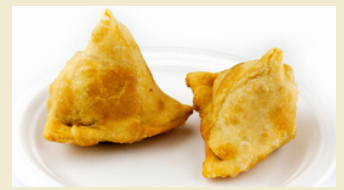
Samosa 2pcs $20